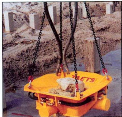
Expotech Multiplier piling hammer installs on excavators

They can be suspended from an excavator or crane, and were used extensively on the Brisbane Airport Rail Link project. ■